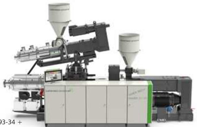
twinEX 93-34 + conEX NG 54 coex

Material costs can be significantly reduced by using recycled materials in co-extrusion. A combination of high-grade PVC production waste or recycled materials (old windows) with virgin PVC is possible. Depending on the requirements, the co-extruder can be mounted directly above the main machine (piggyback) or positioned on the floor at an angle.