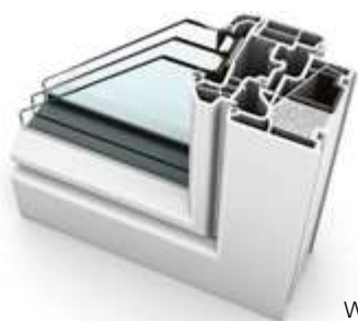
Window profile Internorm®