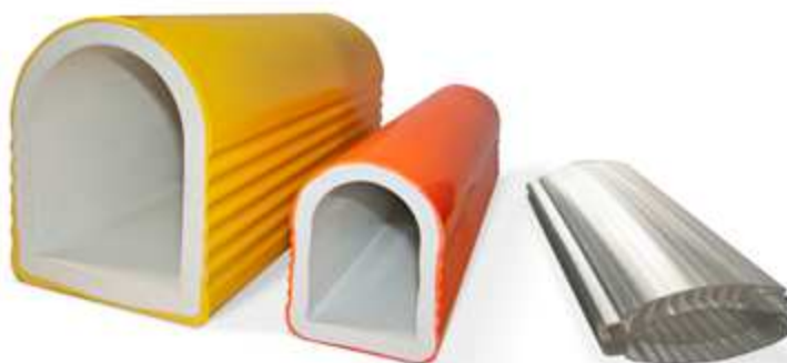
Co-extruded protective profile photo MPM®